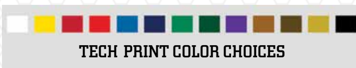
Photo emulsion of paint onto blades and metal handles. Up to two (2) colors per surface. The Tech Print is semi-permanent.