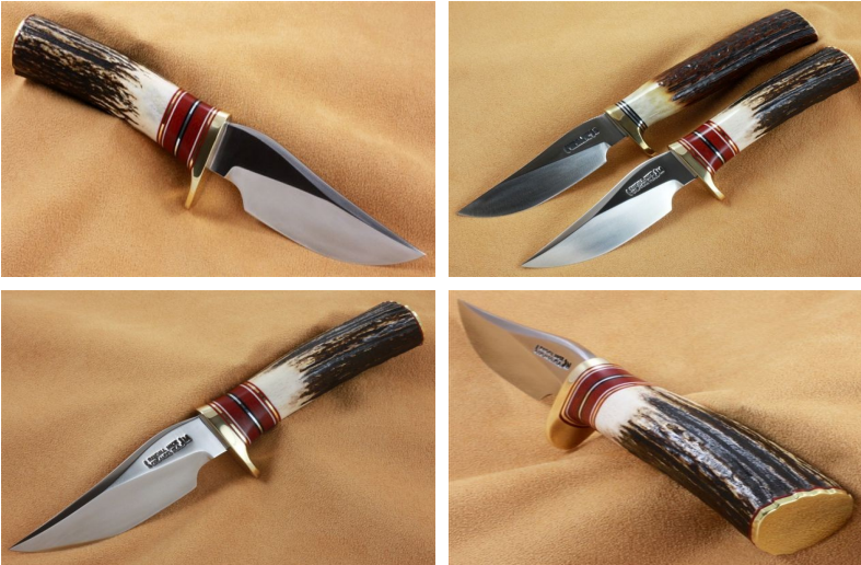
Mini #27 shown with my GTR for size comparison